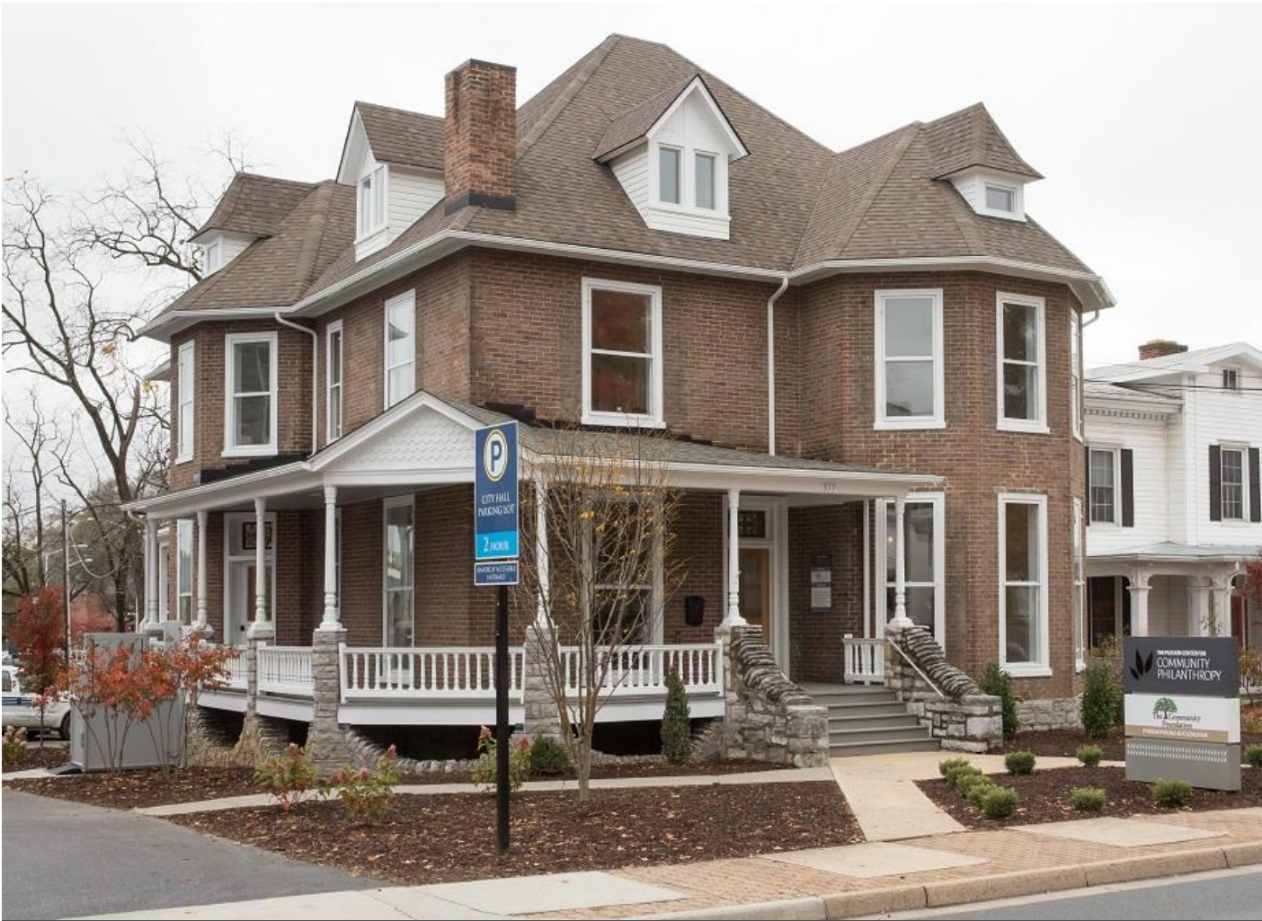
The Plecker Center for Community Philanthropy serves as a unique and collaborative nonprofit space in downtown Harrisonburg.