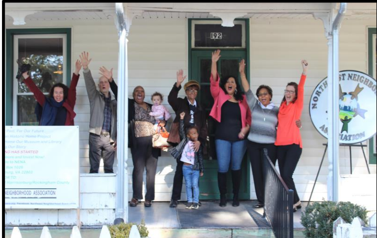
Celebrating at the Dallard-Newman House dedication

Constructed in 1875 at 192 Kelley Street, the historic Dallard-Newman House is one of the oldest in Harrisonburg, and an enduring monument to African American culture and heritage. The building, constructed by freed slaves in 1875, was purchased by the Northeast Neighborhood Association (NENA) in 2018. The Community Foundation was privileged to assist NENA as it secured funding for the purchase. The house, a designated Virginia Landmark , and an enrolled site on the US National Register of Historic Places, will be preserved to create the Dallard-Newman House Museum serving the local community, the greater Shenandoah Valley, and the state of Virginia.