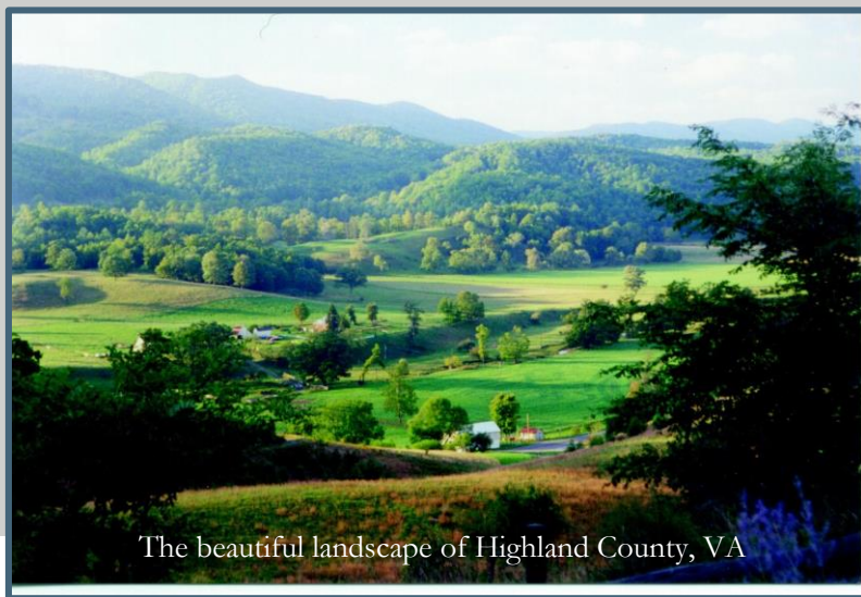
The beautiful landscape of Highland County, VA

The Community Foundation will distribute grants annually, each November, from the Little Swiss Fund to 501(c) (3) tax-exempt organizations in Highland County. Nonprofits located in and serving Highland County, with broad active volunteer support and annual revenues exceeding $25,000, are encouraged to seek grant funding through a competitive application process. Organizations must receive less than half their income from government entities to be eligible.