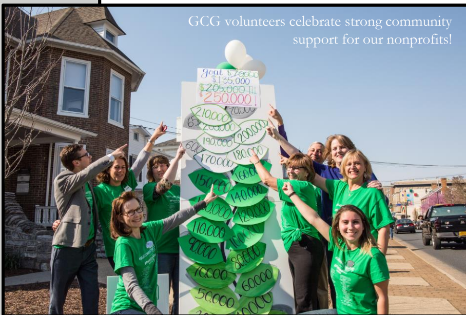
GCG volunteers celebrate strong community support for our nonprofits!

After years of dreaming and months of planning, The Community Foundation facilitated the first community-wide giving day for the benefit of Harrisonburg & Rockingham County nonprofit organizations on April 18, 2018. Business and individual support was incredible, the volunteers worked tirelessly, and the community response was nothing short of amazing!